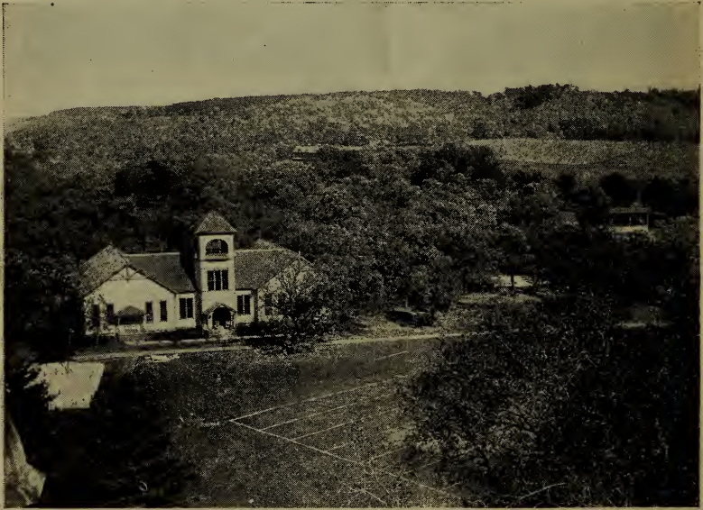
Gymnasium, Luther College.

Luther College has established athletic relations with a great number of the well known colleges in the West. From time to time games have been scheduled with the following institutions: Wisconsin University, Ripon, Marquette, Campion, La Crosse Normal, State University of Iowa, Grinnell, Cornell, Ames, Drake, Coe, Upper Iowa, University of Dubuque, Dubuque Collegé, Morning-side, Highland Park, State Teachers, Iowa Wesleyan, Leander Clark, Lenox, Wartburg, State University of Minnesota, St. Olaf, Minnesota Agricultural College, Carleton, Hamline, St. Thomas, Concordia, Macalester, Gustavus Adolphus, St. John, St. Mary, Winona Normal, Shattuck, University of Nebraska, University of North Dakota, and North Dakota Agricultural College.